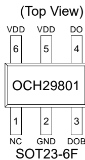
Figure 1, Pin Assignments Of OCH29801